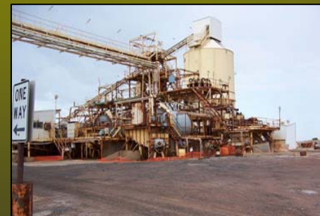
Mt Gibson Mill: 1M tpa