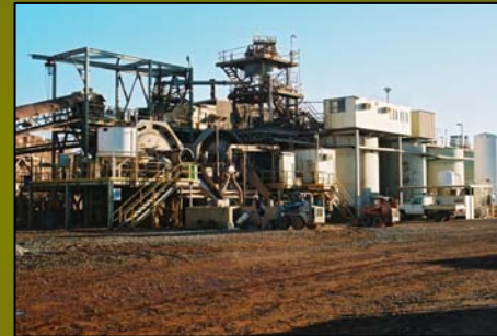
Gidgee Mill: 650,000 tpa