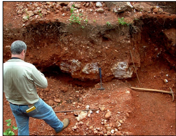
LEGEND TEAM AT ARTISANAL WORKINGS AT TAPARE