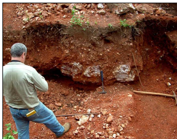
LEGEND TEAM AT ARTISANAL WORKINGS AT TAPARE