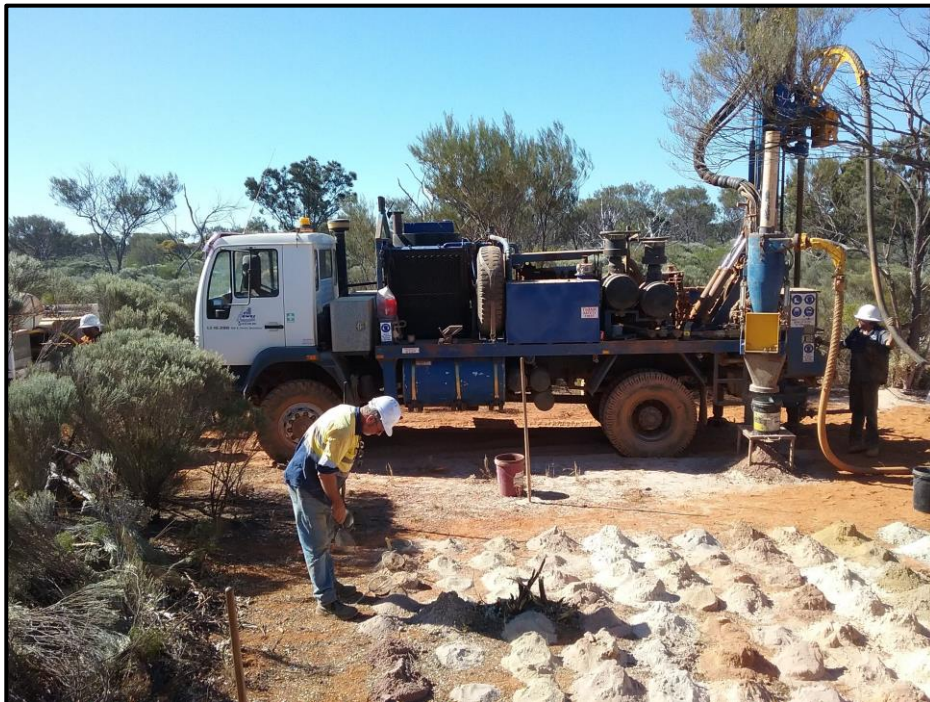
Aircore Drilling at Rockford Project