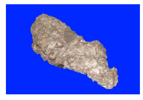
Figure 1: Giant silver nugget weighing 165kg discovered at Elizabeth Hill

Silver was mined from the Elizabeth Hill underground mine between 1998 and 2000, with 16,800 tonnes of ore mined producing 1,170,000 ounces of silver which at today's prices would have a gross value of AUD$21 million.