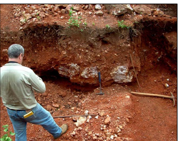
LEGEND TEAM AT ARTISANAL WORKINGS AT TAPARE